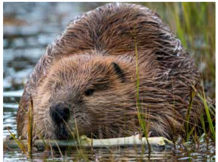
Beaver photo by Jean Beaufort, public domain.

Beavers are native to California—from the high Sierra all the way down to the coast. Beaver dams also play a key role in protecting ecosystems during drought and in regulating the spread of wildfire. Unfortunately, the European fur trade decimated their populations, and by the early 1900s very few beavers remained in California. Today, beaver populations are on the rebound—just in time to help us deal with increasingly intense wildfire seasons. Thanks