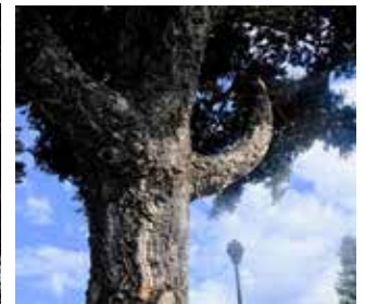
Above: Cork oak with its distinctive spongy bark that is used for making corks.