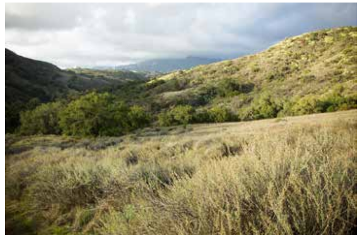
Coastal sage scrub at Starr Ranch.