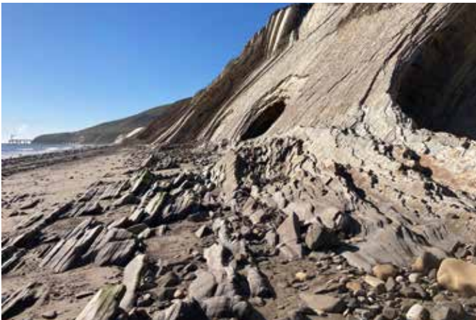
Monterey Formation at Gaviota Beach East.

The Monterey Formation defined the coastline in Santa Barbara and is a constant companion when we walk along