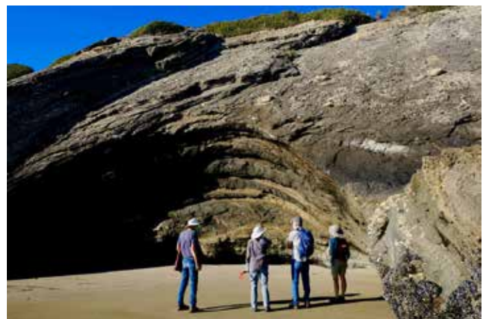
Right: Examining the cliffs near the Gaviota gullies.