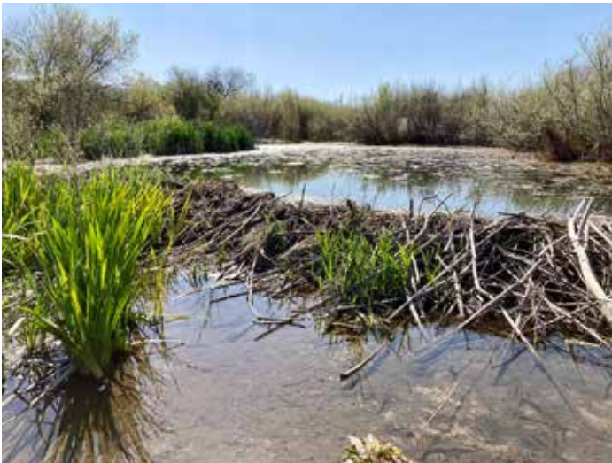
Beaver dam in Atascadero.

to recent conservation initiatives, we may start seeing a lot more beaver dams in our local watersheds—including in and around the Santa Ynez River. So what exactly do beavers do, how do they protect us from wildfire, and what is the current state of beaver policy in California? Come to this talk and find out—it'll be a dam good time!