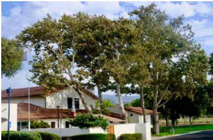
California sycamores at the entrance to Solvang's Veteran's Hall.

Solvang is home to a diversity of native and imported trees that are found in both residential and commercial neighborhoods. We'll explore this urban forest on a casual two-mile city walk that will allow us to visit a variety of arboreal species originating from California to around the globe. We'll see some outstanding specimens of trees that are native to the Santa Ynez Valley, such as sycamore and valley oak and also view other California natives, such as Torrey pine, an extremely rare conifer. The trip will also