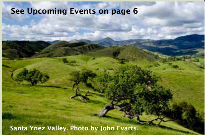
Santa Ynez Valley.

field trips to allow distancing with a transmitter for the leader and individual easy-to-use receivers for participants (who can be up to 100 feet away). We are looking forward to using this system this fall, particularly on upcoming beach field trips. And speaking of fall, we have many events lined up now through December, including Zoom/Webinar lectures and several field trips. We may also be offering one or two "pop-up" events that will be posted on our website, but that are not included in Magpie Calls. Details on all our events can be found here in the Newsletter and on our website, www.syvnature.org .