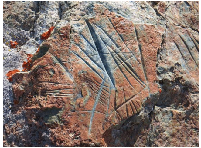
Cultural markings in serpentinite