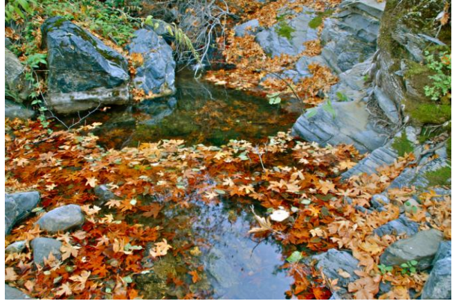
Fall color in Fir Canyon