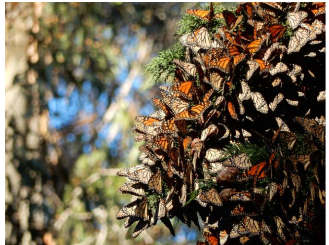
Monarchs in the Pismo Beach grove, photo courtesy of Pismo Beach Conference & Visitors Bureau

Join entomologist Marion Schlinger to visit the Pismo Monarch Butterfly Grove to see the thousands of overwintering monarch butterflies that roost in the branches of stately eucalyptus trees at Pismo State Beach. The field trip follows her previous lecture presentation in December. This monarch site has averaged 25,000 butterflies over the past few years and is considered to be the largest overwintering colony on the California coast. Marion will address their behavior, general biology, requirements of an overwinter site, and natural and man-made threats affecting the monarch butterfly ( Danaus plexippus ). The field trip is timed at the peak of the assemblage of monarchs, which start gathering here in October and start dispersing in February.