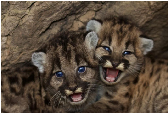
Mountain Lion cubs in the Santa Monica Mountains