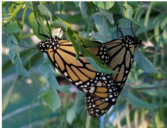
Mating Monarch Butterflies