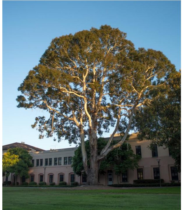
Ribbon Gum tree